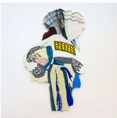
Ana Navas Skirt headed 2023 fused glass