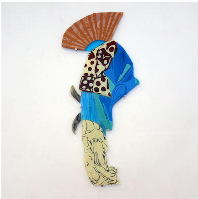
Ana Navas Tangram Fish 2023 fused glass