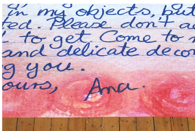
Ana Navas Monument (detail) 2024 digital print on PVC banner