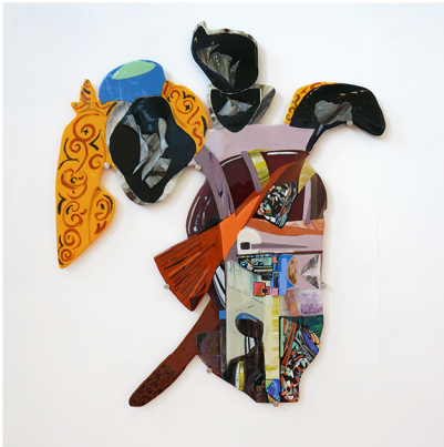
Ana Navas Fauteuil 2024 fused glass