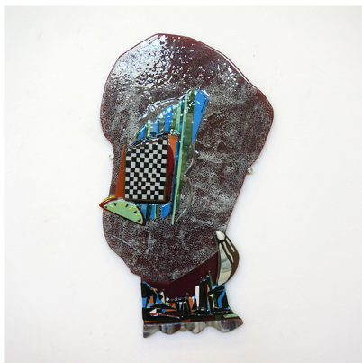
Ana Navas Spanish lace with an orange mouth 2023 fused glass