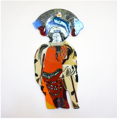
Ana Navas Vase pouring prints 2024 fused glass