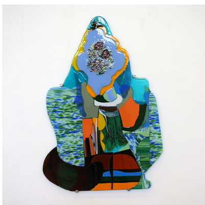
Ana Navas Floral complexion 2024 versmolten glas